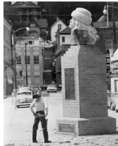
Wild Bill Hickok Monument, teen ager looks on