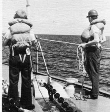
I don't see the mail buoy yet.