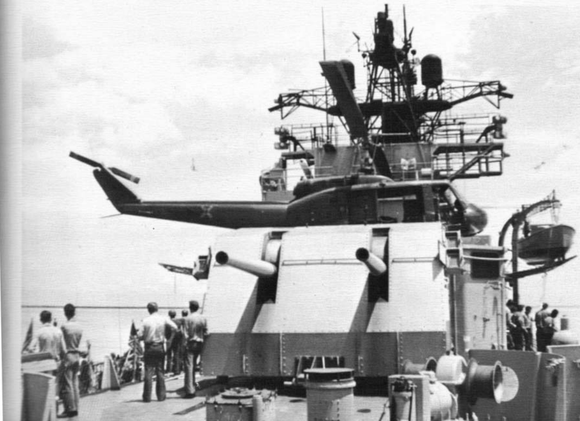
Helo on deck