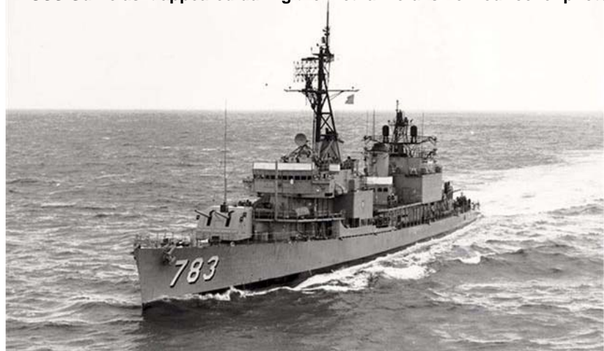
USS Gurke as it appeared during the Vietnam era is now our cover photo

Anyone learning of the death of a former crewmember please notify the newsletter so their passing can be acknowledged in TAPS and on the Honor Roll at the reunion memorial service.