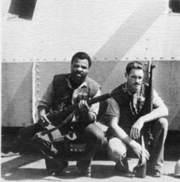
We should have been Marines.