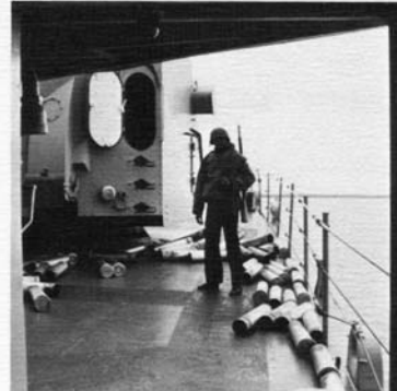
I bet we scared them that time.