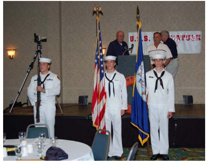
Sea Cadet Color Guard at the opening ceremonies of the 2006 USS Pawcatuck reunion in Nashville.

Watch B has the ship's patch on its face.