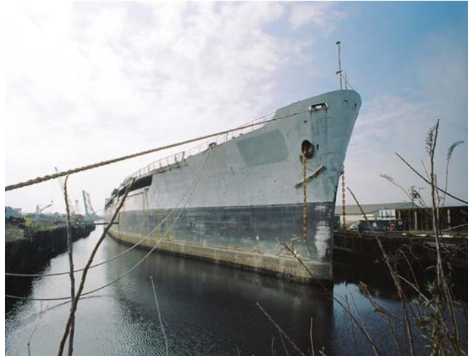
This picture of the USS Pawcatuck was taken by Capt. Russell during a visit to the ship at Bay Bridge Enterprise scrap yard.

Watch A has the picture of the ship on its face.