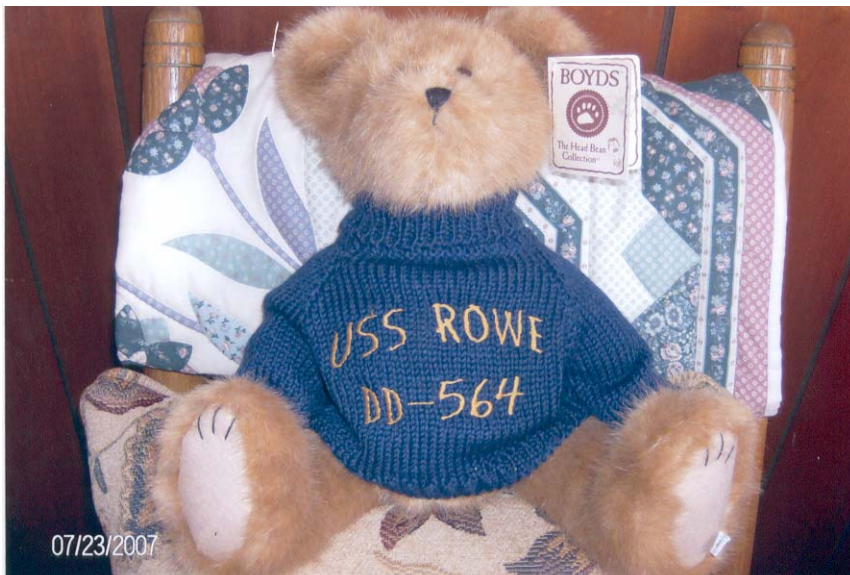
Carl Cramer's Boyd's Bear wearing a USS Rowe DD-564 sweater