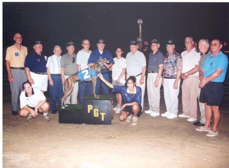
Selected members of Rowe/Watts reunion group at the Pensacola Greyhound Racetrack

One idea that has proved successful for some other ship's newsletters is to have everyone write and tell about the most memorable character you knew while aboard your ship. Tell us about him. Was he funny, a practical joker, a super-nice person, or just your best friend. We have had some really good responses from other ships and hopefully you will have some good ones too. Get out your pen or computer and start writing. If you want to mail in a story, our address is on page two. If you want to e-mail it, use the e-mail address on page two beside NEWSLETTER. Please participate!