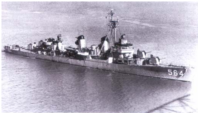
USS ROWE DD-564