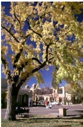
Santa Fe Plaza

Santa Fe: A visit to New Mexico is not complete without a visit to this photogenic and historic capital city. On the way to Santa Fe, a visit to a western movie set can be arranged. This town was built for the filming of "The Cheyenne Social Club." While touring the set, you'll hear about all of the great actors who have filmed here (Jimmy Stewart, John Wayne, Clint Eastwood, to name a few).