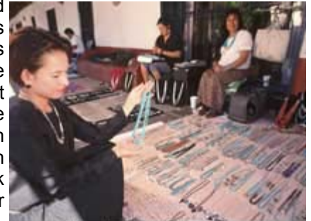
Shopping in Historic Old Town

American and Anglo heritages. A shopper's and photographer's dream, Old Town Albuquerque is full of enticing nooks and crannies where you will find quaint merchant shops in the true southwestern style all located within a ten minute walk from each other. For the romantic in you, horse drawn carriages