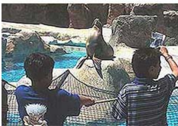
RIO GRANDE ZOO