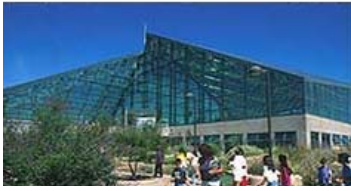
RIO GRANDE BOTANICAL GARDENS