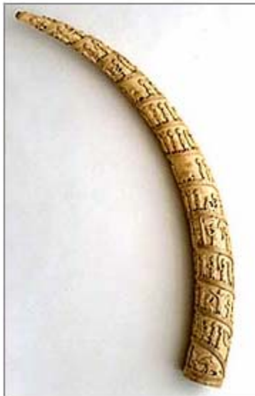
WORK OF THE MONTH CARVED ELEPHANT TUSK LOWER ZAIRE

images ranging from 19th-century pioneers, such as LeGray and Robinson, to contemporary artists, such as Mann, Close and Lopes. The Chrysler Museum of Art has been called "one of the pleasantest places in the United States to while the day away." ( New York Times )