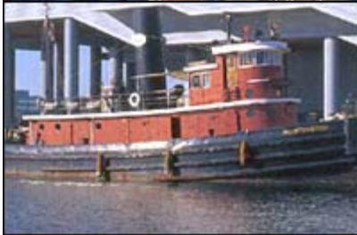
Tug Boat Museum at Nauticus