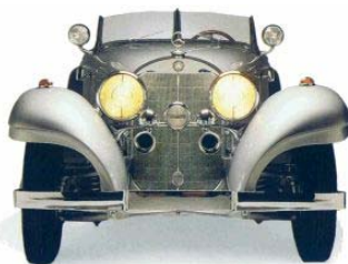
NATIONAL AUTOMOBILE MUSEUM