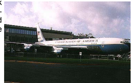
THE FIRST AIR FORCE ONE

Seattle's Museum of Flight tracks the history of aviation. Become a fighter pilot for a moment when you jump into the cockpit of an F/A-18, or pay your respects to space exploration at the Apollo exhibit and Rendezvous In Space. Visit Boeing's original plane, the B&W, in the awe-inspiring six-story steel and glass Great Gallery. Then, wrap up your tour with a lesson on the early days of aviation in the Red Barn, Boeing's original plant, and a walk through presidential history aboard the first Air Force One.